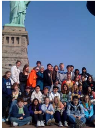
Taking in the sites included visiting the Statue of Liberty and Ellis Island