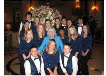
Ms. Duckworth surrounded by Showstoppers just before they perform