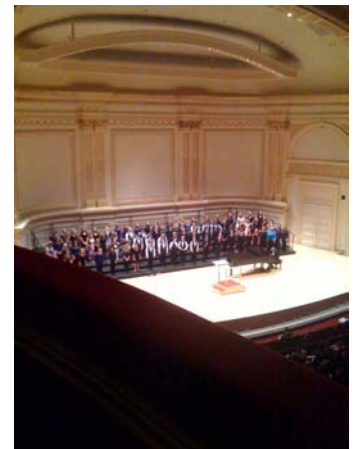
The National Middle School Choir, which includes Calvary students, warms up on the Carnegie stage