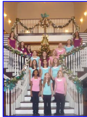
CES Serenity Singers at Winter Wonderland Luncheon last week (See another Choir photo on P. 4)

On Dec. 4, her "Serenity Singers" performed four beautiful Christmas numbers for the crowd at the Annual Winter Wonderland luncheon, in support of Richmond State School, at Safari Texas. The singers were well received by audience members, even receiving an invitation from one of those in the audience to perform at a Christmas luncheon in Downtown Houston!