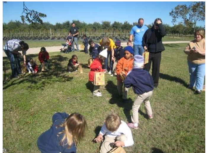
PKers busy collecting acorns at the Randolph's tree farm

At lunch, we enjoyed hot apple cider and we all enjoyed the fall decorated tables by Amy Randolph. It was a fun-filled, busy day! Many thanks to Gary and Amy Randolph and all of the parents that made this trip possible!