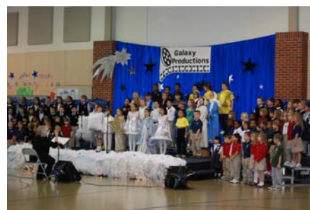
Kinder through third grade students presenting "Once Upon a Christmas Light"

choirs performing their "Winter Hope" Concert and the CES band, which will perform on Thursday evening at 7pm.