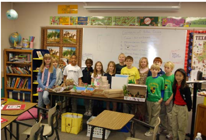
Students "show off" their exhibits of their Texas history studies

Last Friday fourth graders boarded their charter bus at 6:30 am. Almost twelve hours later they returned to Calvary after having visited and studied at The Institute of Texas Cultures, the San Jose Mission and The Alamo. Students, parents and teachers returned tired, but filled with excitement and knowledge about some of the most famous landmarks in their Texas history studies.