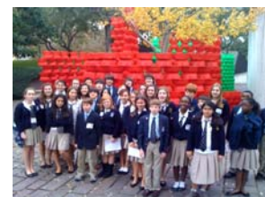
CES Art Students enjoy a trip to the Houston Museum of Fine