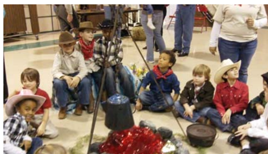
At the PK-2nd Grade party in honor of the Auction, students enjoy learning about how things were back at the George Ranch in the 1800's!

Auction officials strongly urge those who are attending to get to the event at 6:30 pm, as the published schedule will be closely followed.