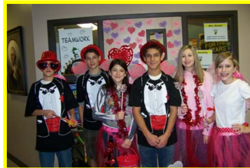
Eighth graders served as Special Delivery agents during Valentine Book Day.

Just a reminder, Calvary's annual spring book fair will kick off on March 2 nd and run through March 6 th . It