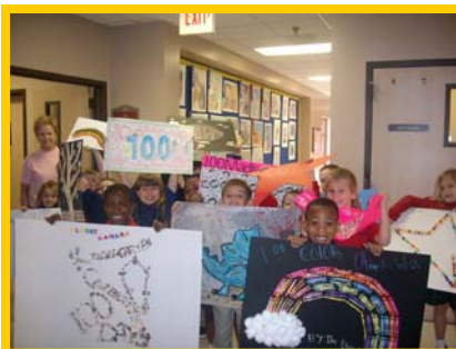
As part of their math studies, kinder students enjoy a parade showing off their "100 day of School" projects.