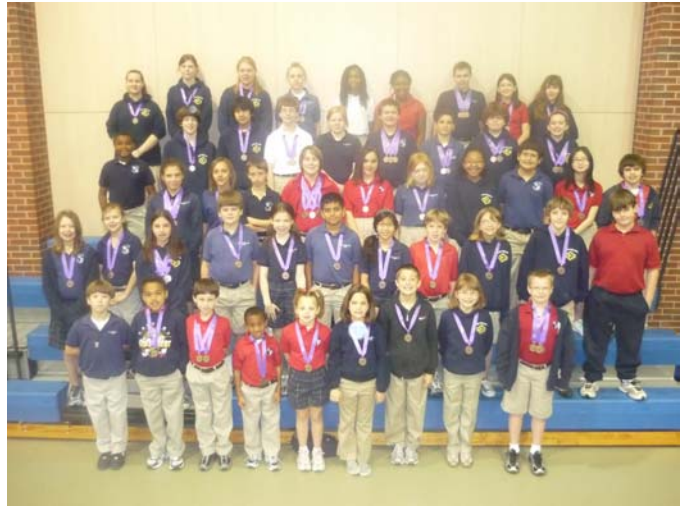
Students who placed at the PSIA competition proudly display their medals