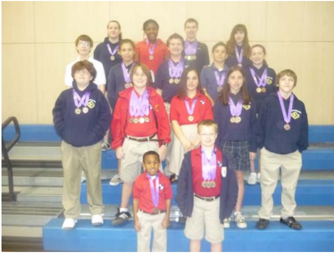
Twenty students won first or second place to advance to state at TCU in Fort Worth