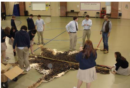
CECP students "investigate, hypothesize and deduce"

We then had to measure the hide, that's right, the giraffe hide, to see just how long a giraffe really is. He also explained to us that he actually went to Africa to bring this animal back!