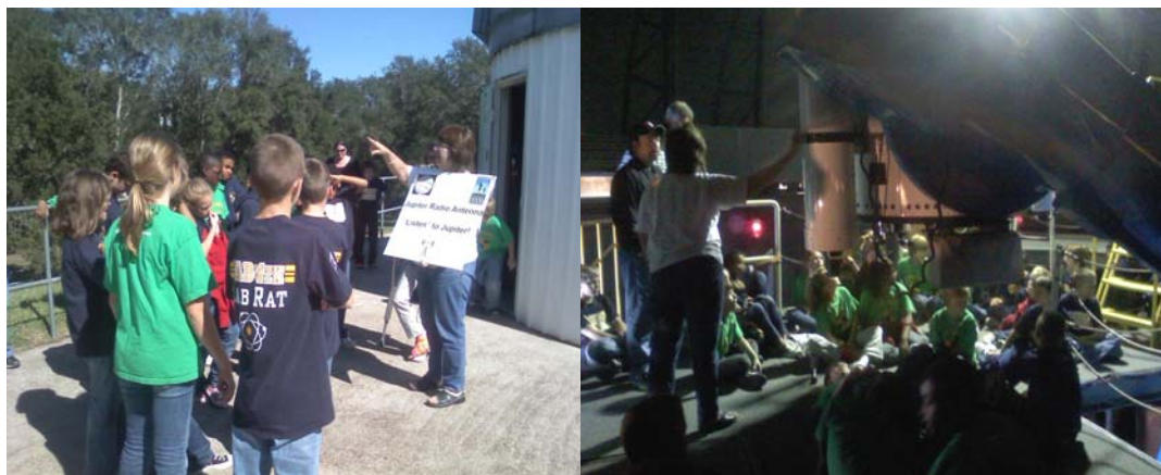
Fifth Graders take in the sites at George Observatory. Students on the left are listening to a docent telling about the telescope and students on the right are about to become part of the Challenger Mission simulator.

cost. There have been various homework assignments each night this week that have to do with studying the water and energy usage in their homes. When the program is completed each student will have not only had the opportunity to be a leader in their homes and in their community, but also will have learned how their families can benefit from lower utility bills and how they, as individuals can help conserve our precious water! We can make a difference!