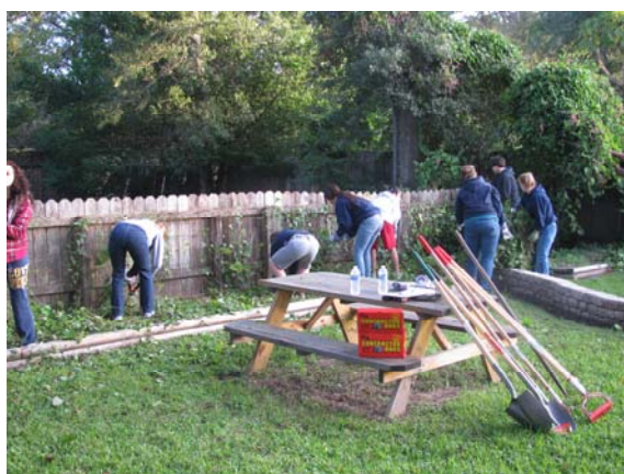
CECP students with hoes, shovels and rakes, busy at work on the WIC garden of Fort Bend Family Health Center.