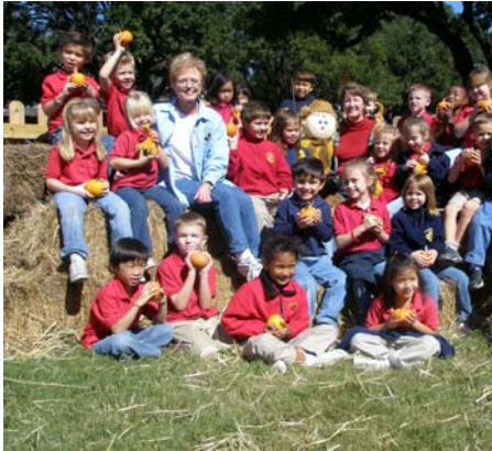
Kindergarten students (and teachers!) enjoying a beautiful fall day on a recent field trip to The Pumpkin Patch.