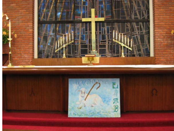
The Lamb of God as painted by CES/CECP art students.